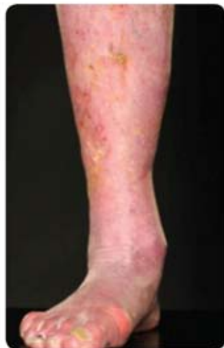
Figure 4. Fully healed after eight weeks of treatment.

in the author's clinical experience, foam dressings provide the perfect balance between fluid-handling capabilities and maintaining moist wound healing.