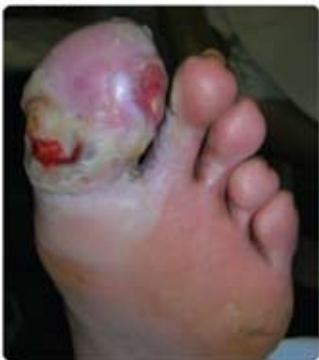
Figure 6. 48 hours after treatment with Advazorb.