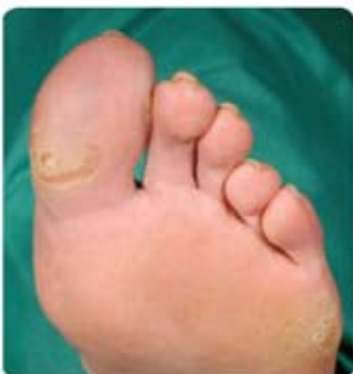
Figure 7. Complete healing after three weeks of treatment.

at dressing change, thereby ensuring that the surrounding fragile skin and newly-formed granulation tissue is protected.