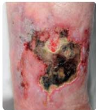
Figure 2. Ulcer at presentation.